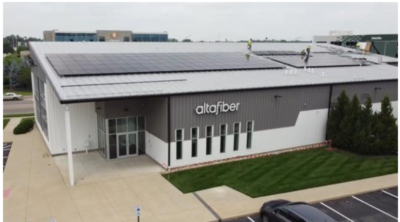
The Dayton office and store is powered by 177 solar panels that will annually produce around 86,400 kilowatt-hours, enough power for 100% of its needs.